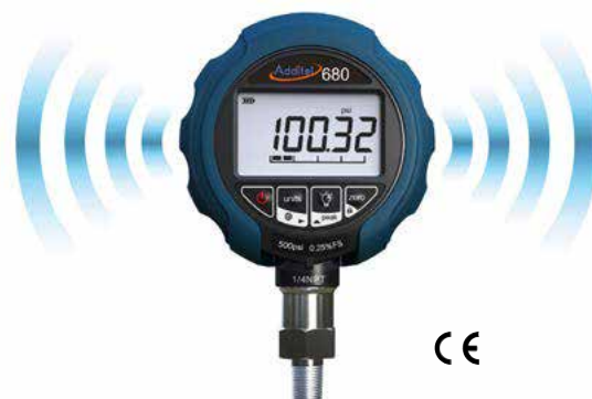
680 with data logging and wireless (optional)